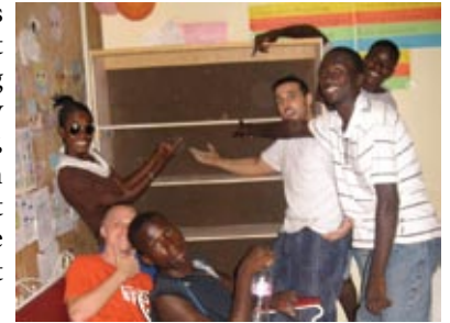
Young men building a bookcase for the ecclesial hall.