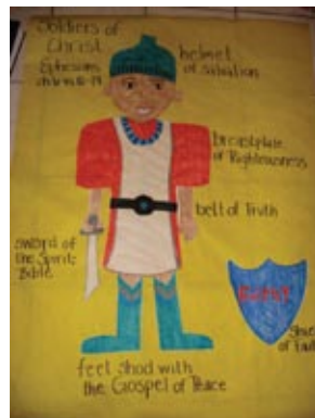
At a primary school, we made this poster to illustrate "the whole armor of God." The staff liked it so much, they hung it in the school library!