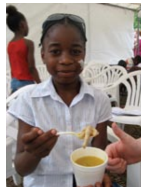
Chicken foot soup