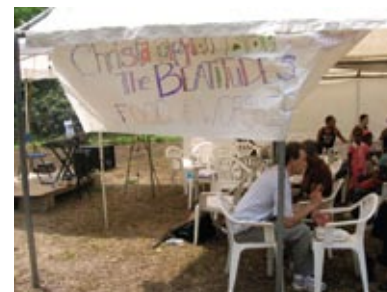
The tent seminar was a tremendous success. We advertised by word of mouth, leafletting, and hanging this sign on the tent.