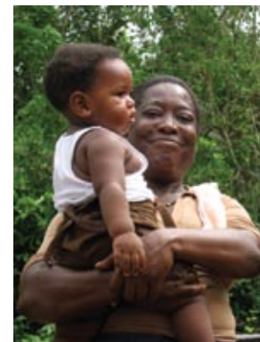
A seminar attendee and her grandson