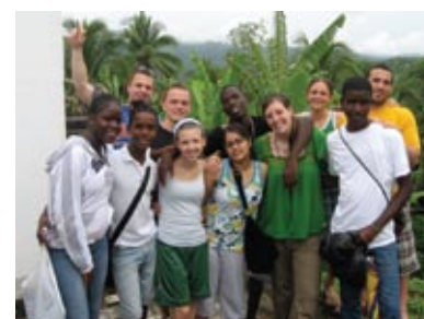
The week-two team & company.